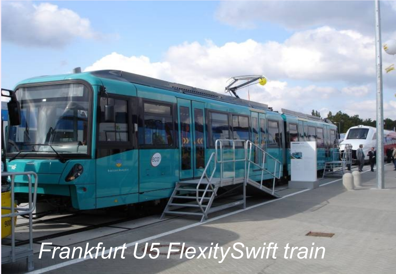
Frankfurt U5 FlexitySwift train